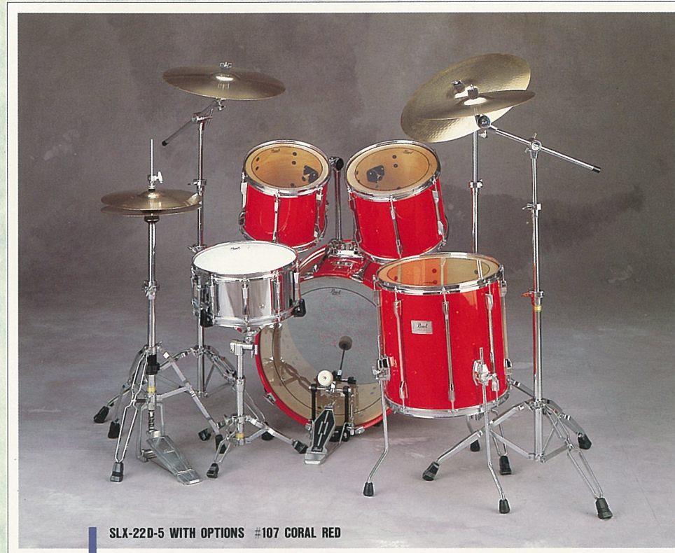
SLX-22D-5 WITH OPTIONS #107 CORAL RED

SLX-222D: 16"×22" Bass Drum, SLX-210ED: 10"×10" Tom Tom, SLX-212D: 10"×12" Tom Tom, SLX-214D: 12"×14" Tom Tom, SLX-216D: 14"×16" Tom Tom, SX-614D: 6½"×14" Snare Drum, H-850WN: Hi-Hat Stand, P-880: Foot Pedal, S-850W: Snare Drum Stand, C-850W: Cymbal Stand, B-850W: Cymbal Boom Stands (2), T-980W: Twin Tom Stand, TH-95: Tom Holders (2)