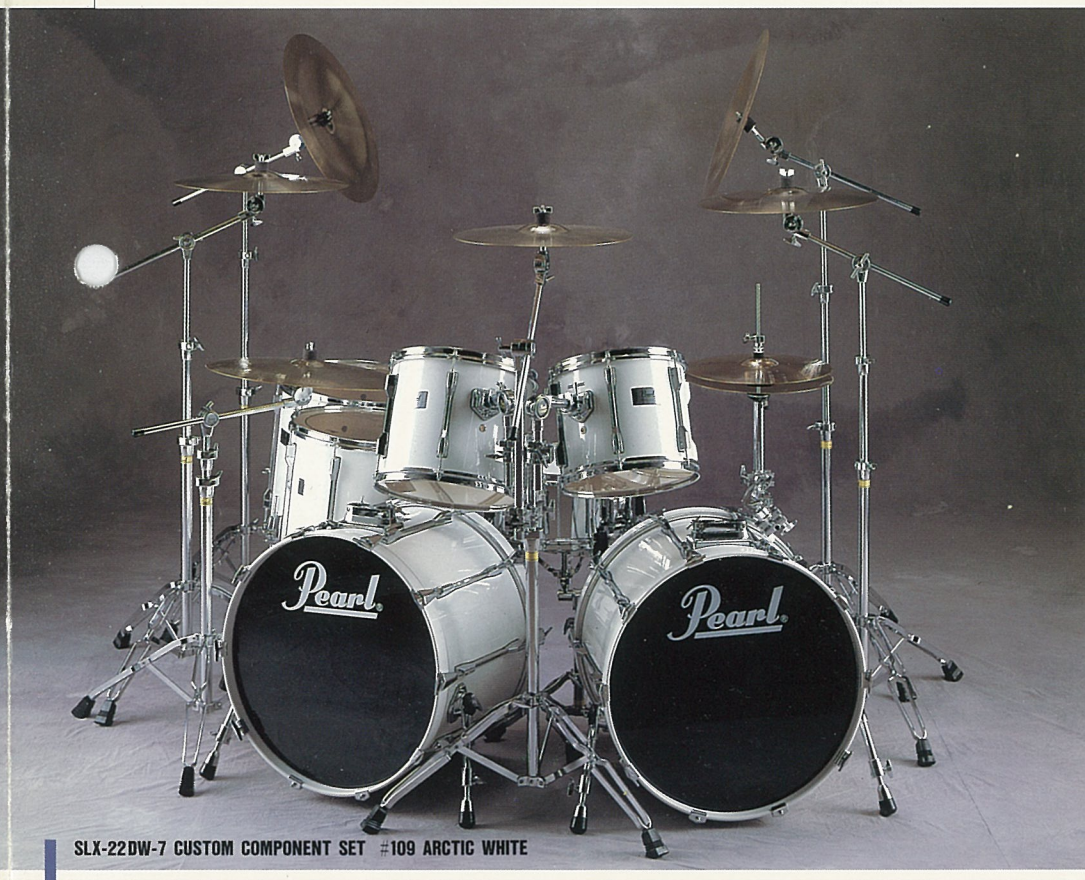
SLX-22DW-7 CUSTOM COMPONENT SET #109 ARCTIC WHITE

SLX-222D: 16"×22" Bass Drum, SLX-212D: 10"×12" Tom Tom, SLX-213D: 11"×13" Tom Tom, SLX-2116: 16"×16" Floor Tom, SX-614D: 6½"×14" Snare Drum, H-850WN: Hi-Hat Stand, P-880: Foot Pedal, S-850W: Snare Drum Stand, C-850W: Cymbal Stand, B-850W: Cymbal Boom Stands (2), TH-95: Tom Holders (2)