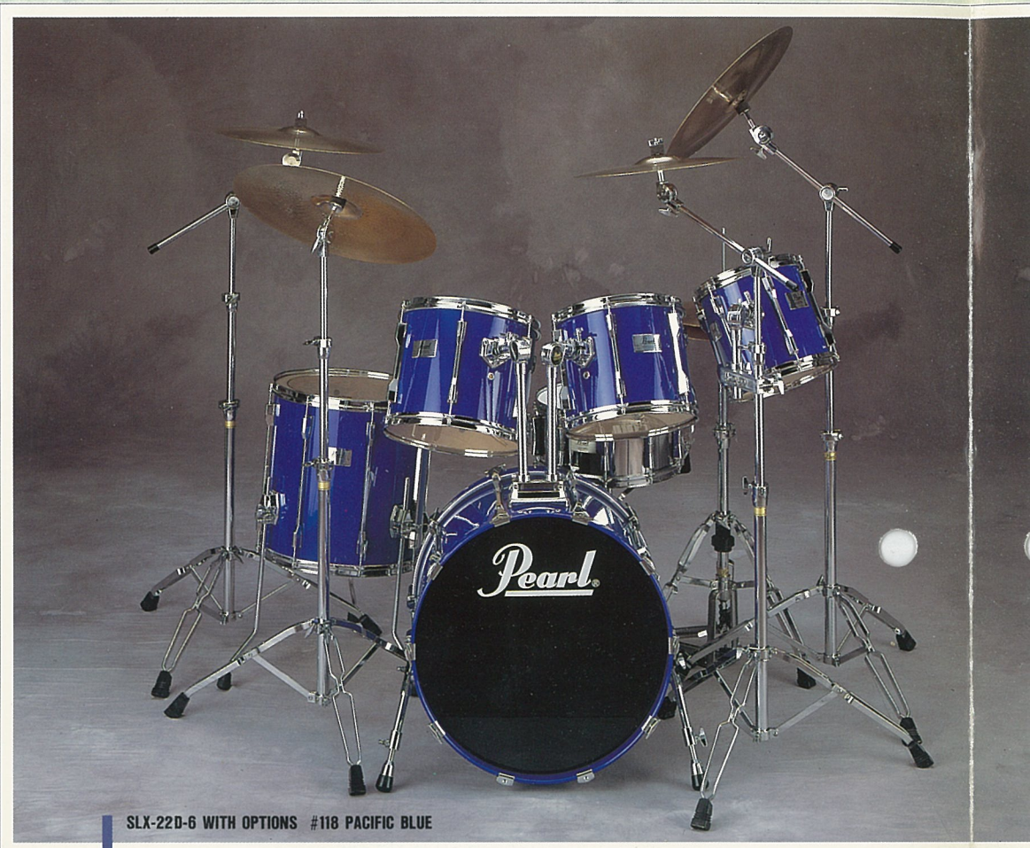
SLX-22D-6 WITH OPTIONS #118 PACIFIC BLUE

SLX-222D: 16"×22" Bass Drum, SLX-210ED: 10"×10" Tom Tom, SLX-212D: 10"×12" Tom Tom, SLX-213D: 11"×13" Tom Tom, SLX-2116: 16"×16" Floor Tom, SX-614D: 6½"×14" Snare Drum, H-850WN: Hi-Hat Stand, P-880: Foot Pedal, S-850W: Snare Drum Stand, C-850W: Cymbal Stand, B-850W: Cymbal Boom Stands (3), TH-95: Tom Holders (2), TH-95S: Tom Holder, AX-20: Adapter