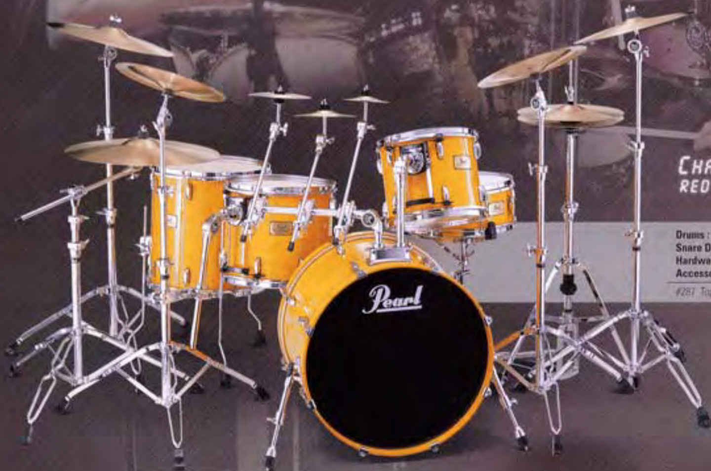
CHAD SMITH RED HOT CHILI PEPPERS

Drums : SRX1822B, SRX1012T, SRX1214T, SRX1616F Snare Drum : SRX5514S Hardware : H-855, P-101P, S-850, C-855W (4), B-855W Accessories : TH-90 (2), CH-70 (2), AX-28