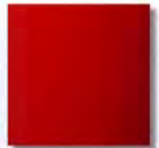
#286 Cranberry Mist