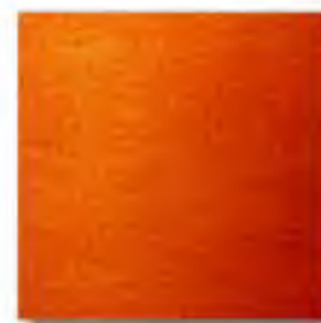
#288 Burnt Amber