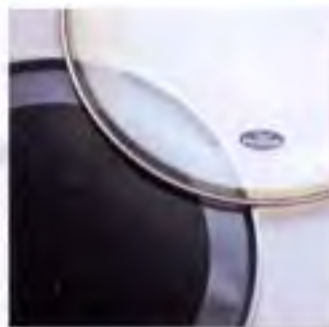
Pearl ProTone Heads

All Session Custom SRX bass drums feature our SP-30 telescoping bass drum spurs. Designed for the professional drummer, the SP-30 spur is extremely quick to position, easy to adjust, and with its quarter turn spike to rubber tipped feet, it offers the absolute ultimate in stability on most any playing surface.