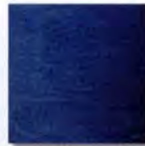
#285 Dusk Blue