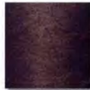
#281 Carbon Mist