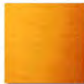
#287 Topaz Mist