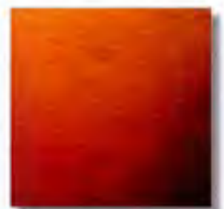
# 290 Vintage Fade