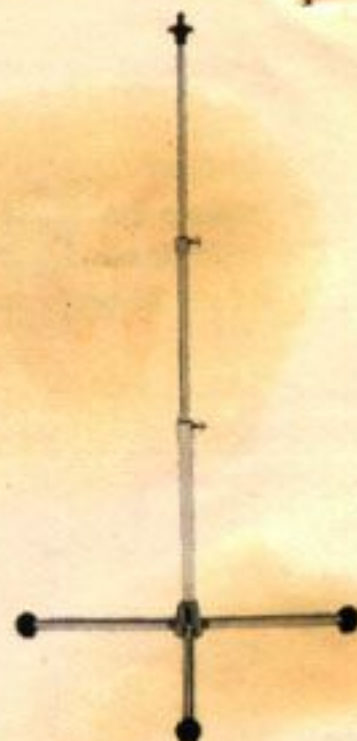
Cymbal Stand Z 5220