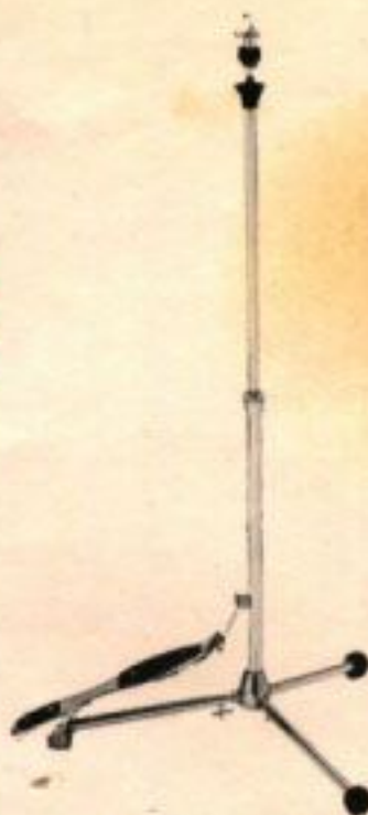
Hi-Hat Z 5451