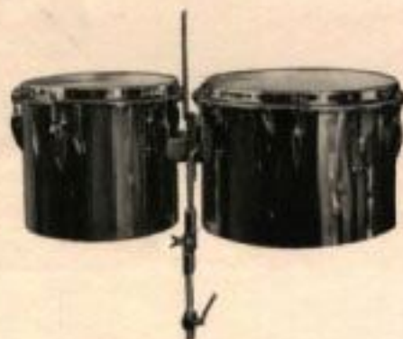
Machito Timbales L 852

14" x 5". Metal shell, chrome triple-plated. Profiled counterhoops, calf heads, 16 tension rods, internal damper, parallel snare with 12 singly operated spirals (patented) - ensures perfect response.