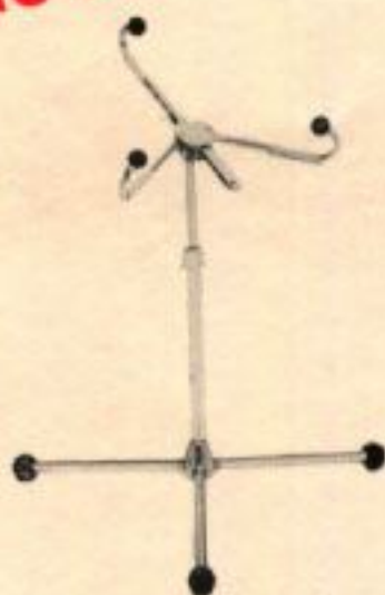
Snare Drum Stand Z 5552