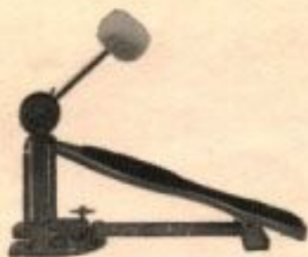
Presto Foot Pedal Z 5318