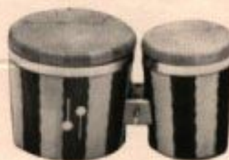
Bongos L 841

10" x 8" and 12" x 8". Chrome-plated metal shell, profiled counterhoops, vellum heads, 6 tension rods. Supplied with folding stand.