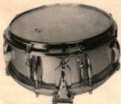
All-metal Snare Drum D 426 Unique Feature - individually adjustable snares

14" x 5". Metal shell, chrome triple-plated. Profiled counterhoops, calf heads, 16 tension rods, internal damper, parallel snare with 12 singly operated spirals (patented) - ensures perfect response.