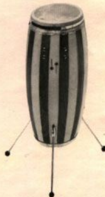
Conga L 823

Solid maple and elm shells, sturdy pigskin heads and central tuning systems 8½" dia. x 7", 6½" dia. x 7".