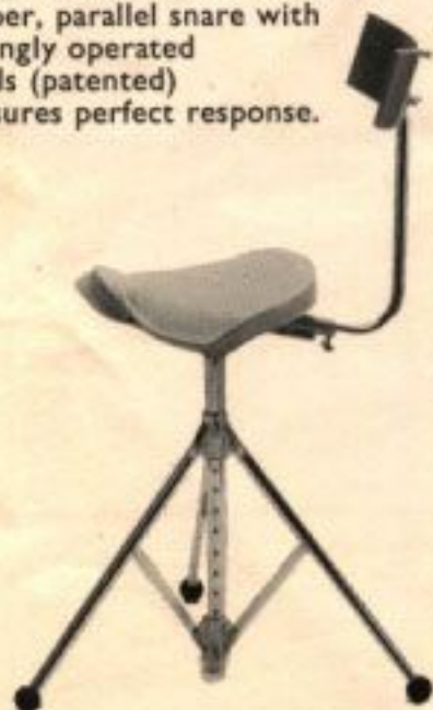
Drummers Stool Z 5801 Fully adjustable, extra strong.

Solid maple and elm shell, sturdy pigskin head, central tuning system, retractable legs 29". Also L 824 25".