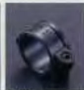
A2 MEMORY LOCK