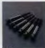
5625 OPTIONAL SQUARE HEAD BOLT