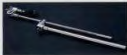
51. CYMBAL HOLDER