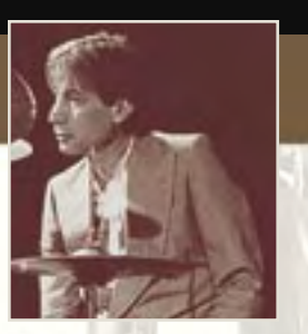
Charlie Watts The Rolling Stones