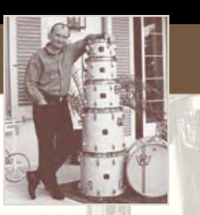
Phil Collins Solo Artist/Genesis