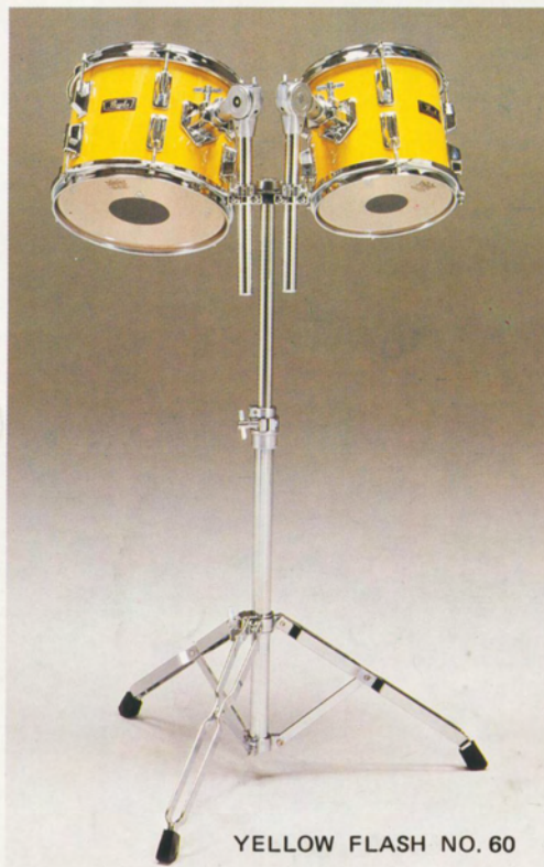
YELLOW FLASH NO. 60