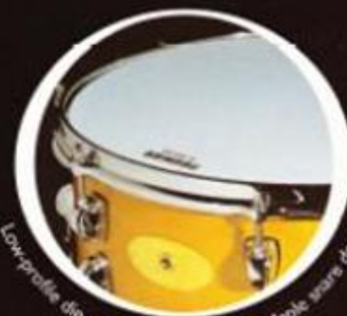
Low-profile die-cast rings on all Artist Maple snare drums