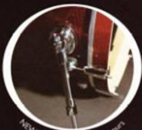
NEW easy-adjust bass drum spurs