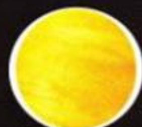
Topaz Lacquer (TL)