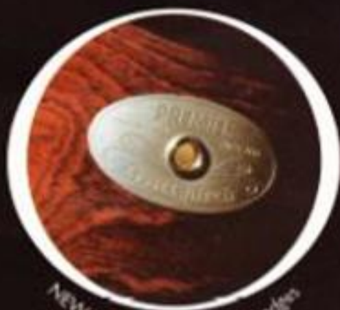
NEW distinctive dedicated badges