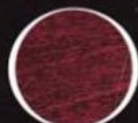
Rosewood Lacquer (RW)