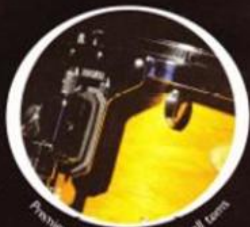
Premier ISO mounts fitted to all toms

All Artist Maple and Birch drums are handcrafted in Premier's 100,000 square feet facility in Leicestershire, England, dedicated to the production of drums, percussion instruments and accessories. With a history of more than 75 years of designing and building drums the Premier name is your assurance of quality, craftsmanship and the very latest in drum innovation.