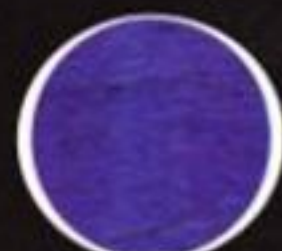
Sapphire Lacquer (SL)