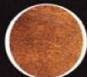
Dark Walnut Satin (DX)