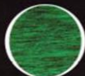
Emerald Lacquer (GL)