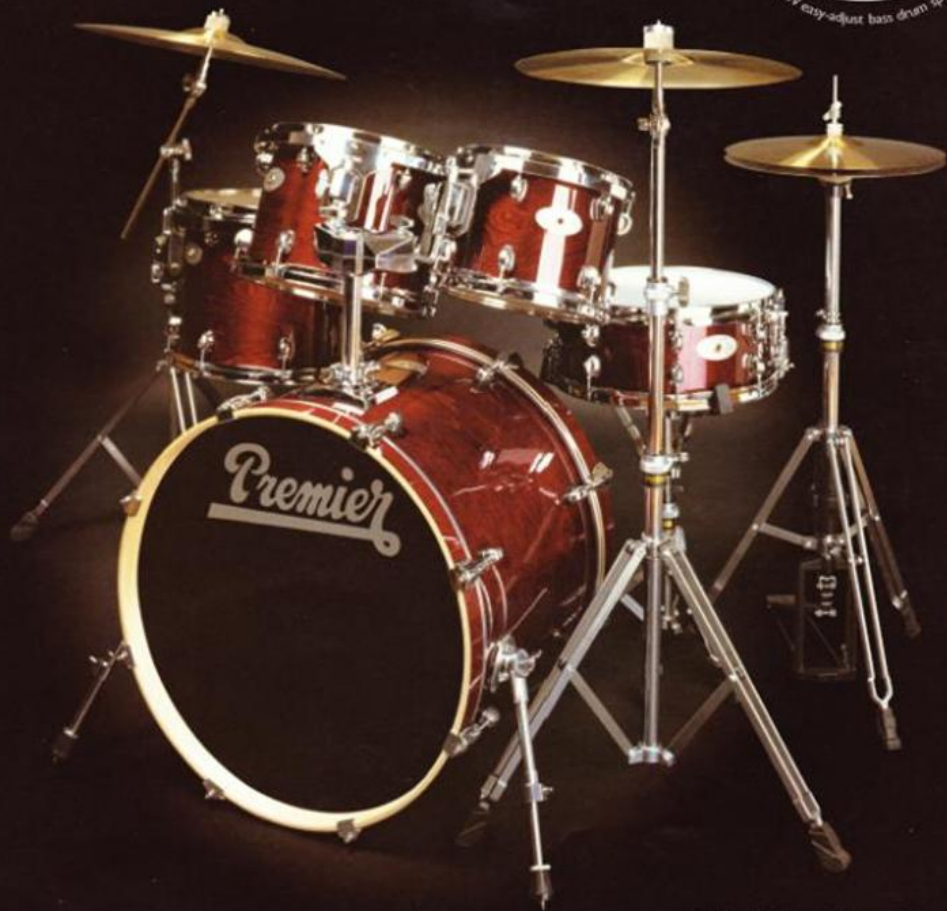
Artist Birch in Rosewood Lacquer (RW)