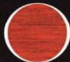
Flame Red Lacquer (RL)