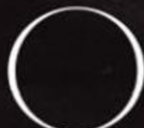
Solid Black Lacquer (BG)