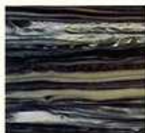
032 BLACK STRATA PEARL