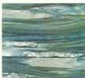
031 BLUE STRATA PEARL

Swiv-a-matic®/PowerTone® and Rogers® Drums are registered trademarks of CBS Musical Instruments, a division of Columbia Broadcasting System, Inc., 1300 E. Valencia, Fullerton, California 92631.