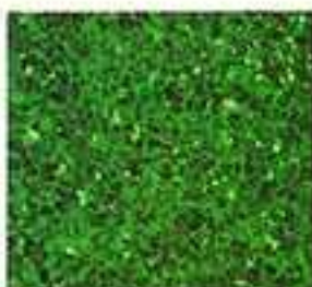
015 GREEN SPARKLE PEARL