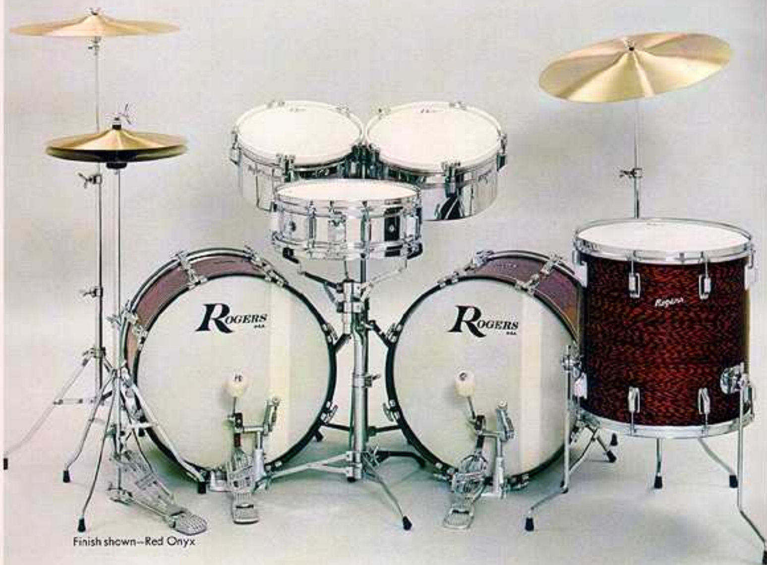
Finish shown--Red Onyx

See Rogers Drum Accessories Catalog for individual cymbals, cymbal assortments, thrones, cases, and other accessories.