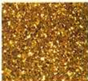
008 GOLD SPARKLE PEARL