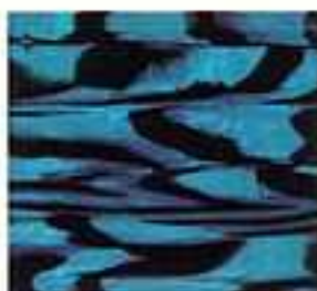
012 BLUE ONYX PEARL