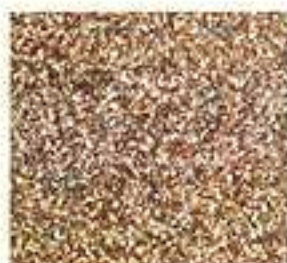
013 PINK CHAMPAGNE PEARL

When ordering Rogers Drums and Accessories, please be specific in providing catalog numbers, sizes and finishes desired. Special orders are on a non-cancellable and non-returnable basis. All drums are supplied with plastic heads. All hardware is chrome. Parts and sub-assemblies not listed appear in the Rogers Parts Catalog. Detailed price list available.