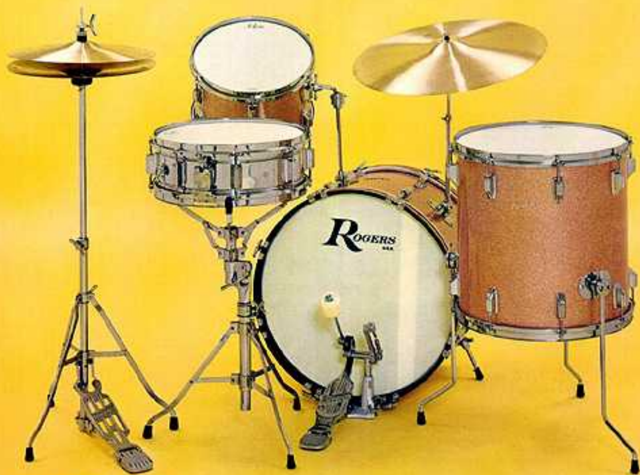
Finish shown—Pink Champagne

See Rogers Drum Accessories Catalog for individual cymbals, cymbal assortments, thrones, cases, and other accessories.