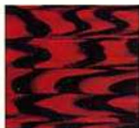
004 RED ONYX PEARL