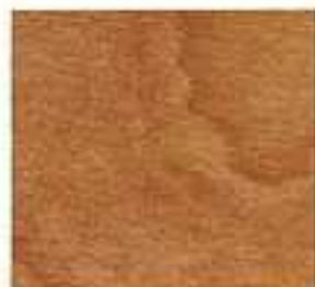
080 NEW NATURAL BIGONI

Sparkling pearl and gleaming chrome spotlight your different talent. The New Rogers Wood-Grain Finishes offer you a beautiful, rich, wood-grain look that is both durable and tough—scratch and dent resistant.