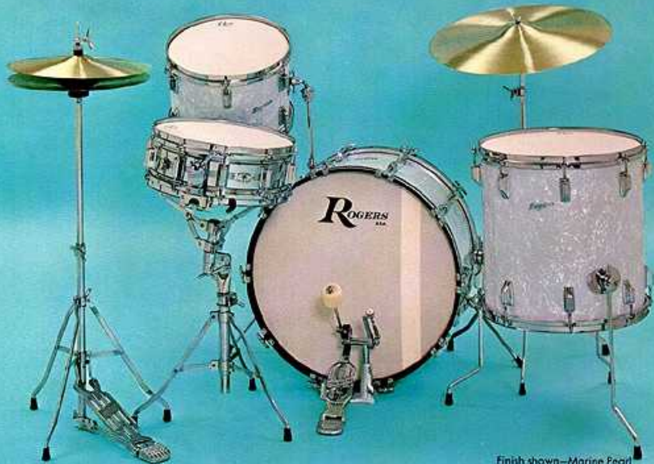
Finish shown—Marine Pearl

See Rogers Drum Accessories Catalog for individual cymbals, cymbal assortments, thrones, cases, and other accessories.