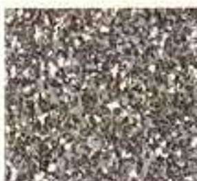
011 SILVER SPARKLE PEARL