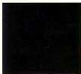
003 JET BLACK PEARL