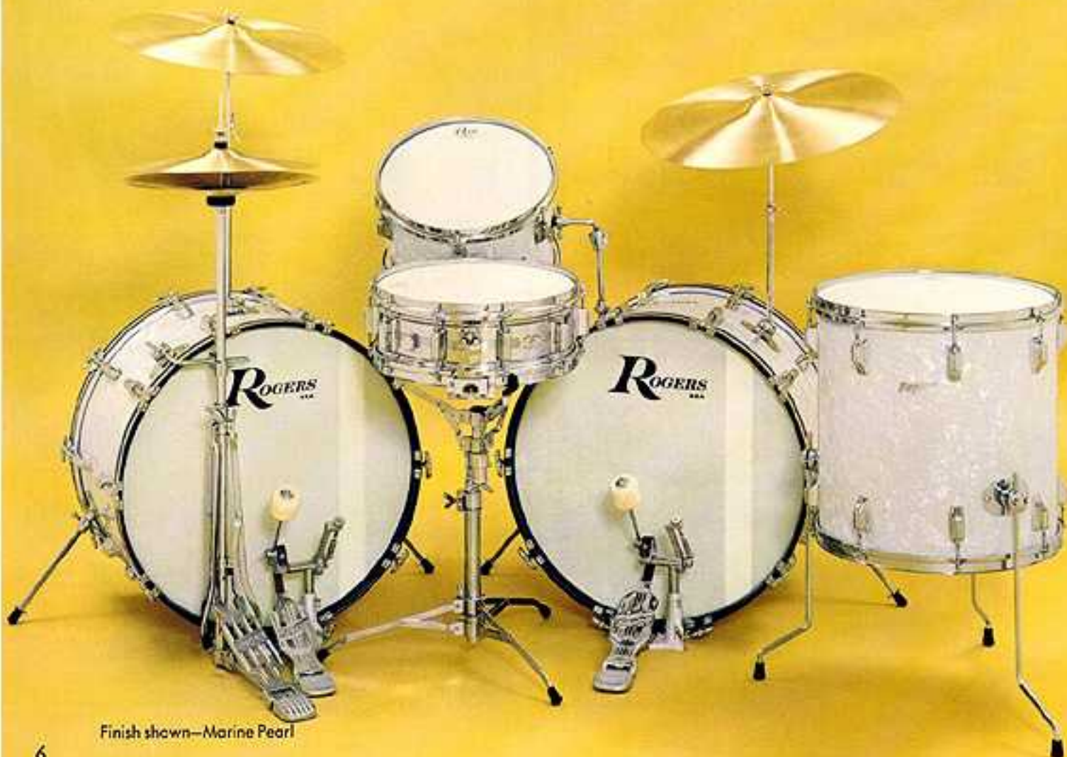
Finish shown—Marine Pearl

See Rogers Drum Accessories Catalog for individual cymbals, cymbal assortments, thrones, cases, and other accessories.