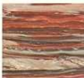
030 PINK STRATA PEARL