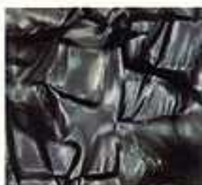
014 BLACK DIAMOND PEARL