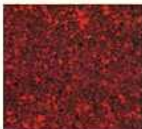
002 RED SPARKLE PEARL