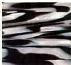
005 BLACK ONYX PEARL