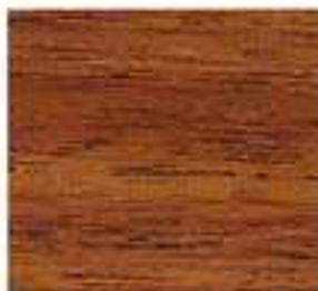
083 NEW KOA