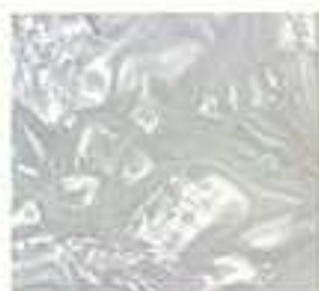
010 MARINE PEARL