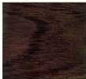
086 NEW MAHOGANY