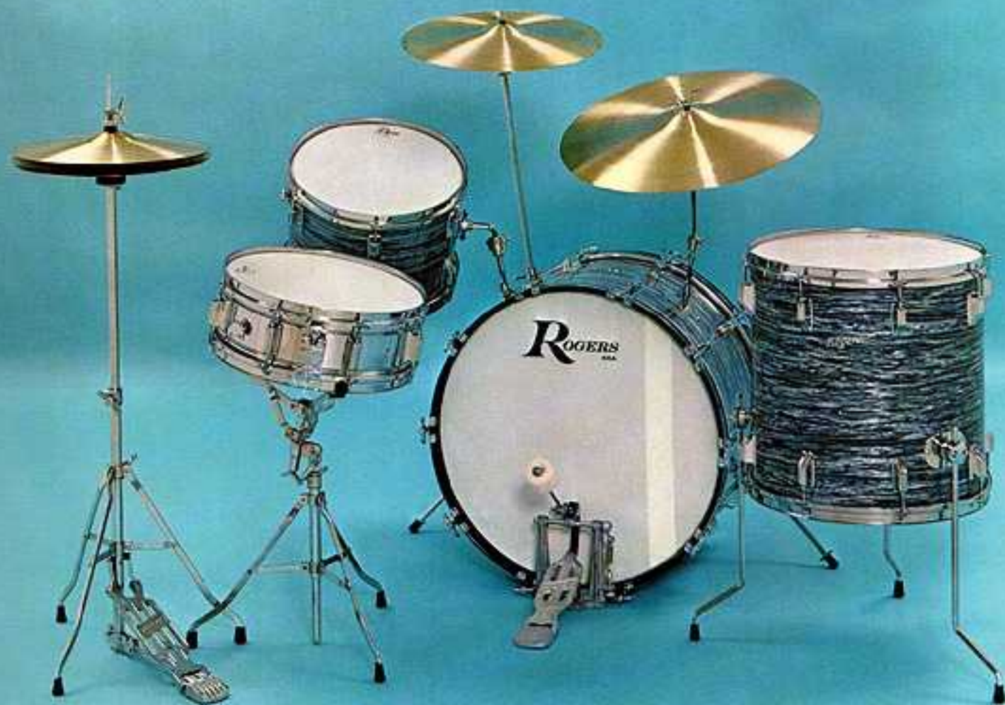
Finish shown—Blue Strata

See Rogers Drum Accessories Catalog for individual cymbals, cymbal assortments, thrones, cases, and other accessories.