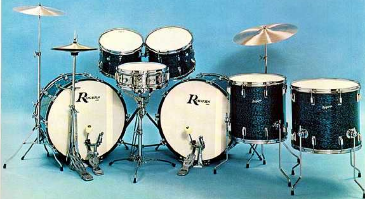
Finish shown—Blue Onyx

See Rogers Drum Accessories Catalog for individual cymbals, cymbal assortments, thrones, cases, and other accessories.